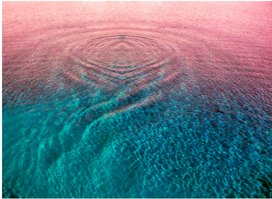
Wake VII, 2004