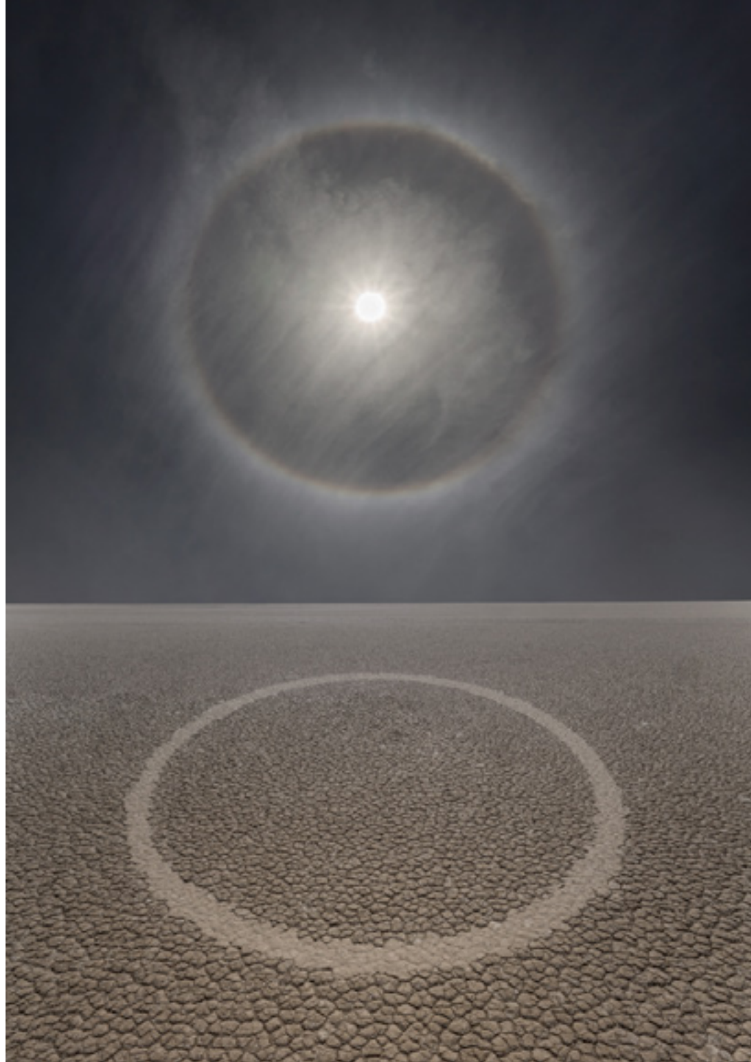
Alignment IV, 2014