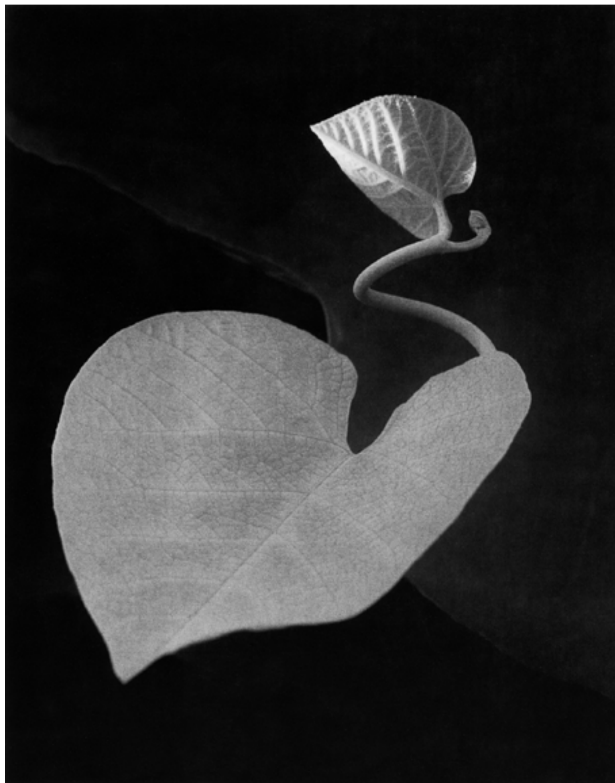
Two Leaves Brewster, New York, 1963