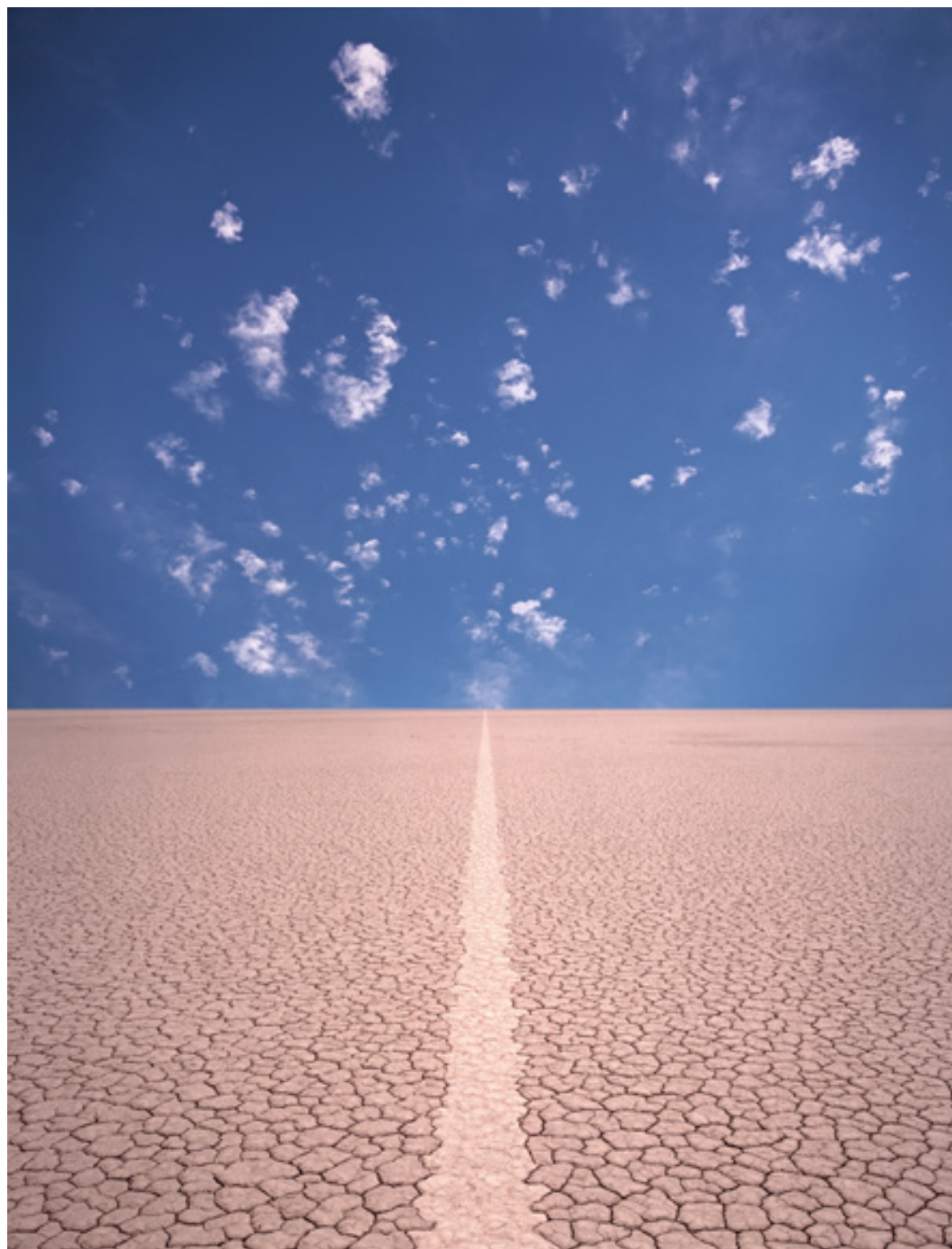
Alignment I, 1999