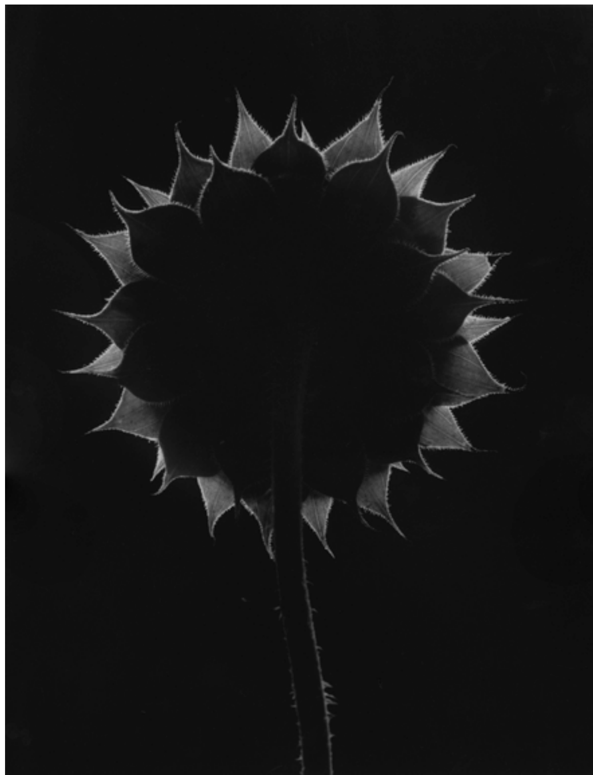
Backlit Sunflower, Boroughbridge, North Yorkshire, England, 1965