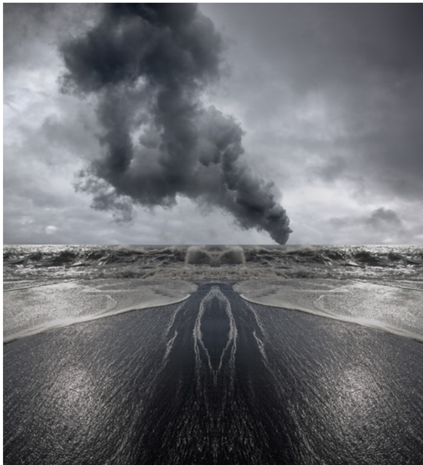
Inhalation XXIX, 2011