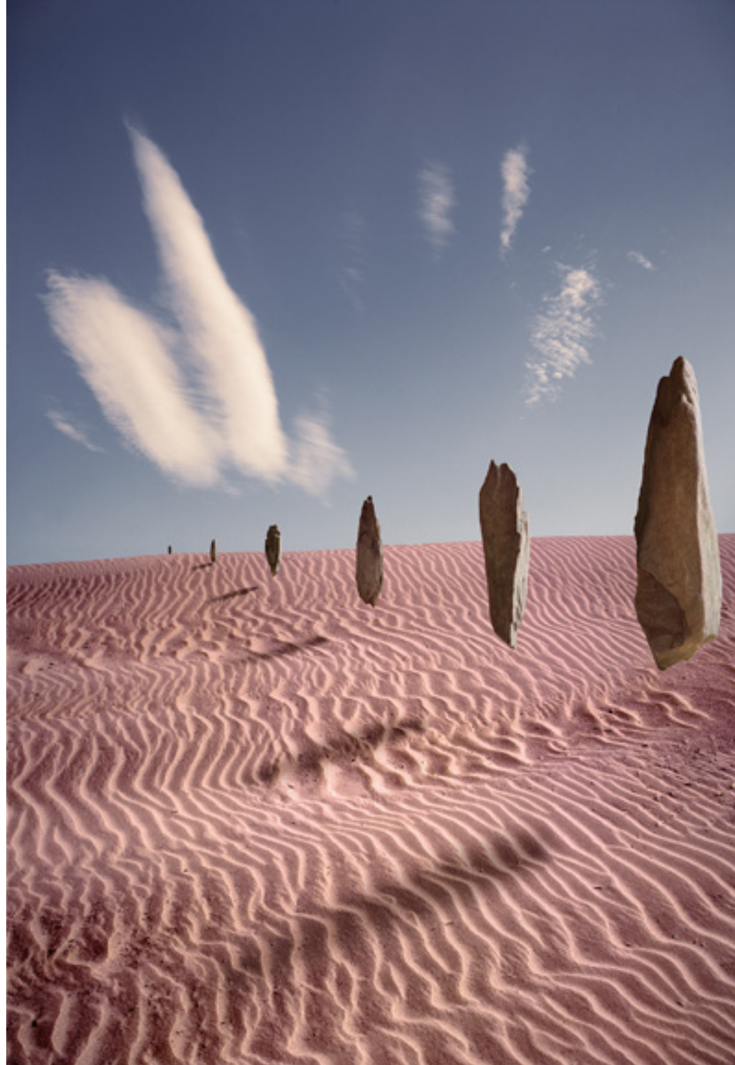
Alignment II, 1999