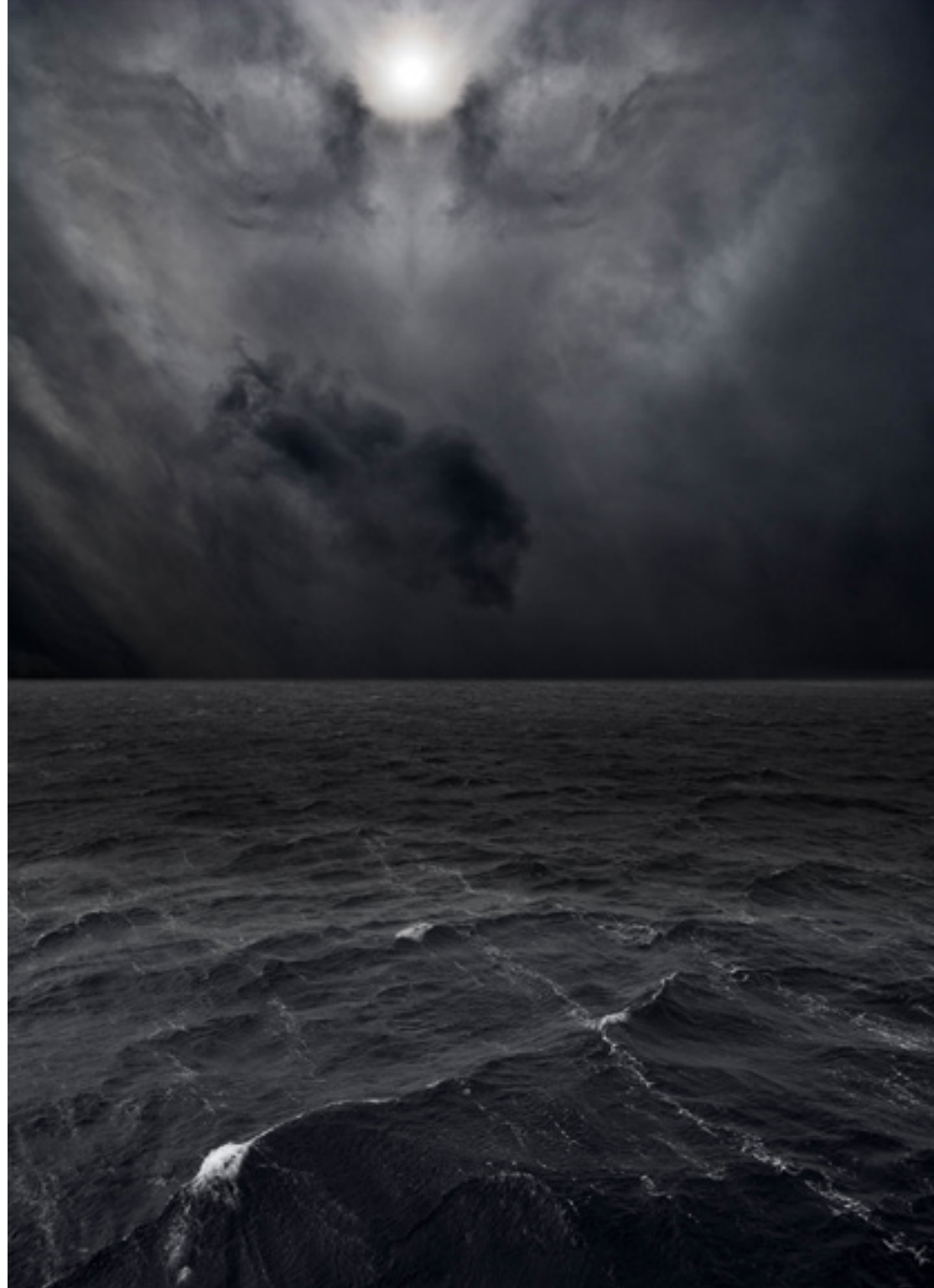
Exhalation XVII, 2007