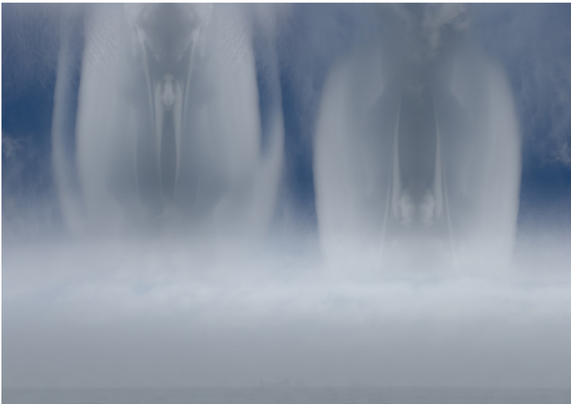
Exhalation XXVII, 2011