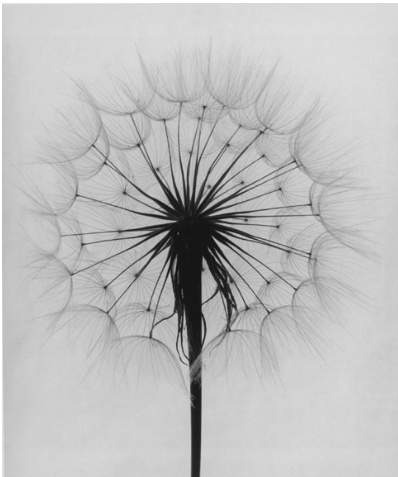
Scott's Thistle, New York, 1958